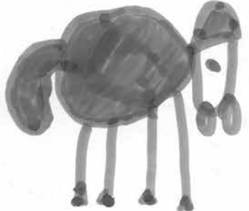
Cover Competition Winner Benjamin Coles